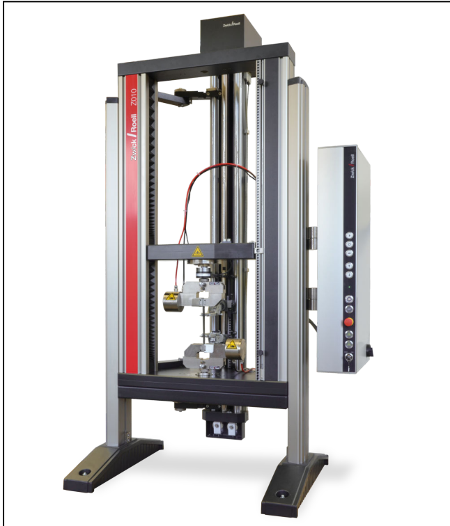
Long-travel extensometer on an AllroundLine Z010