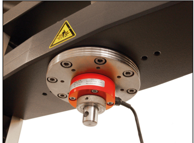
Xforce HP with flange